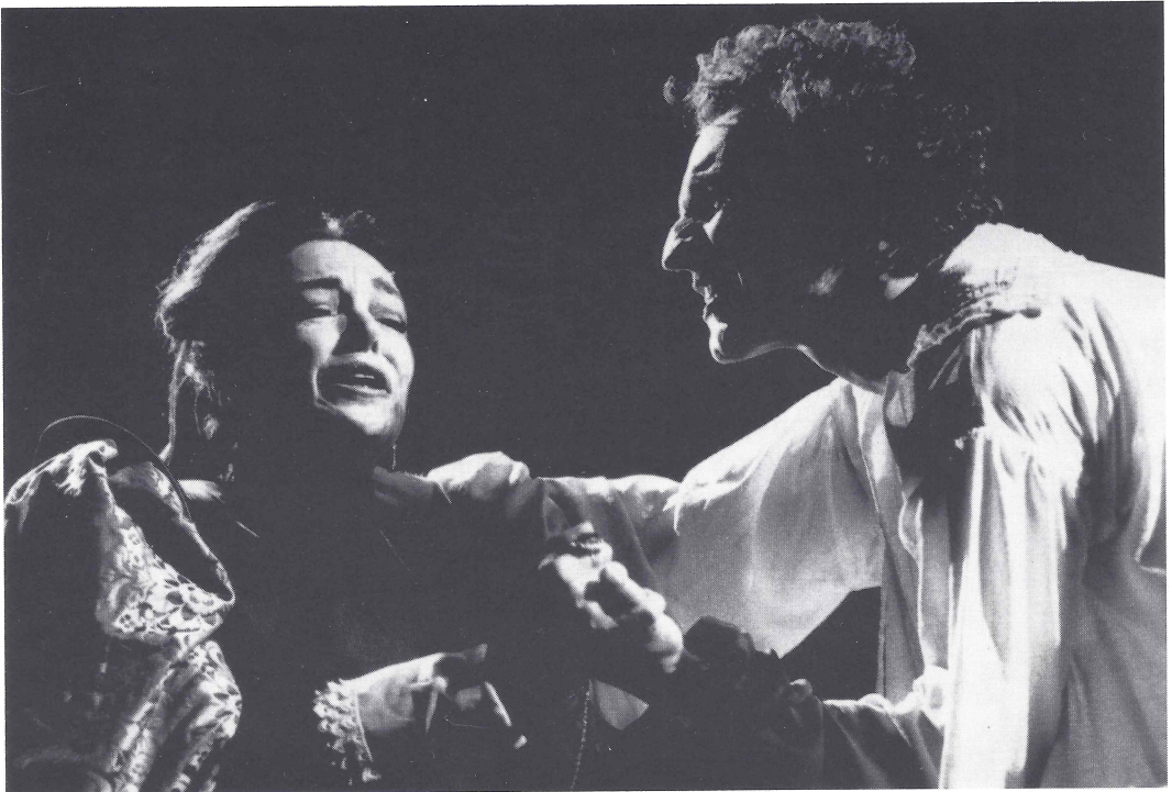
Gertrude: Natasha Parry

MUSIC WILL BE PERFORMED LIVE BY MEMBERS OF THE COMPANY